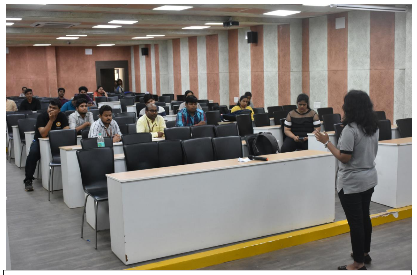
Student's performance on Debate Competition