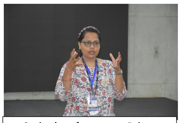
Student's performance on Debate Competition